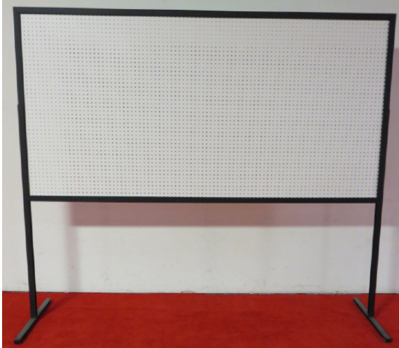
4' X 8' PERFBOARD (Horizontal)